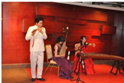
Entertainment in Banquet

18:30-20:30 Symposium banquet and closing ceremony